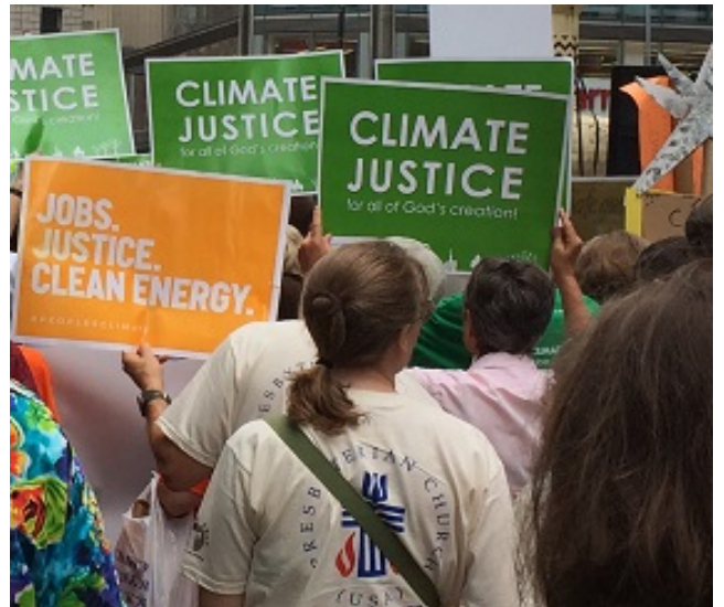
Presbyterians at the People's Climate March in New York City on September 13, 2014

Rulers and kings need to hear our moral voice. We need to use that voice to call out for the health and well-being of the creation. We need to use that voice in worship and in song. As this season of Epiphany begins, shine your light on the darkness.