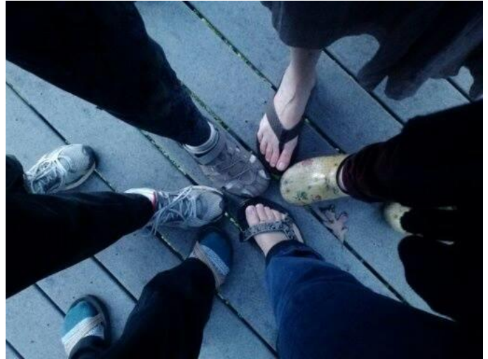
The feet of the women who practiced yoga every morning during the conference.