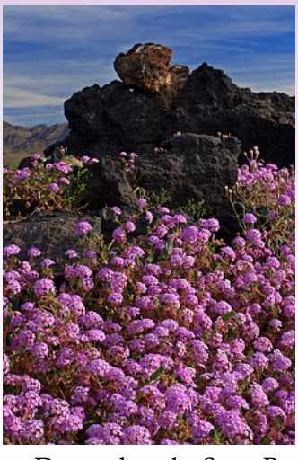
Mojave Desert

Peace, Grace and Hope to you all as we prepare for the beautiful and deeply sacred season of Advent. At this time, late in 2016 particularly, we deeply need those three gifts.