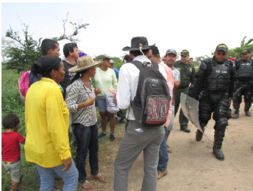
Campesinos consult with their lawyers while riot police walk past in El Tamarindo.

I lost a little weight in December. No, I wasn't planning to jump start any New Year's resolutions. I'd unexpectedly found myself joining the subsistence farmer's diet for a few weeks, as adapted for a vegetarian visitor. I ate soup of yuca and plantain, grown yards away from where we ate, gratefully harvested from land cultivated for a dozen years by my friends, the campesinos of El Tamarindo.