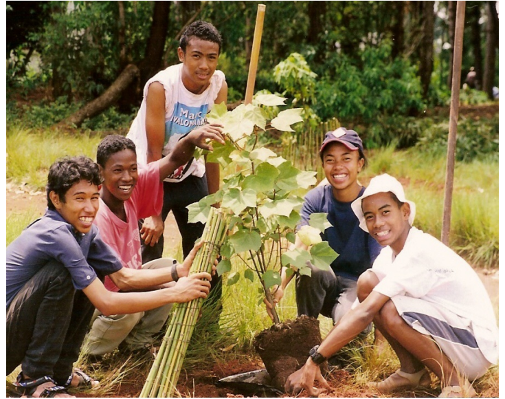
FJKM youth planting a native tree on the grounds of the FJKM Ivato Seminary.

Taking its motivation from Genesis 2:15, “The Lord God took the man and put him in the Garden of Eden to work it and take care of it,” the Fiangonan’i Jesoa Kristy eto Madagasikara (FJKM), PC(USA)’s partner church in Madagascar, recognizes the responsibility humans have for preserving God’s creation. The FJKM is working to reconcile the great needs of the people for food security and the need to protect Madagascar’s biodiversity. PC(USA) is partnering with the FJKM in many of its efforts. The FJKM is teaching new pastors gardening and fruit growing skills. With help from PC(USA), native trees have been planted at churches and schools to promote environmental awareness. The FJKM also contributes to watchdog efforts to protect the country’s natural resources from unscrupulous exploitation. By working in partnership, PC(USA) is helping the FJKM have an even greater impact.