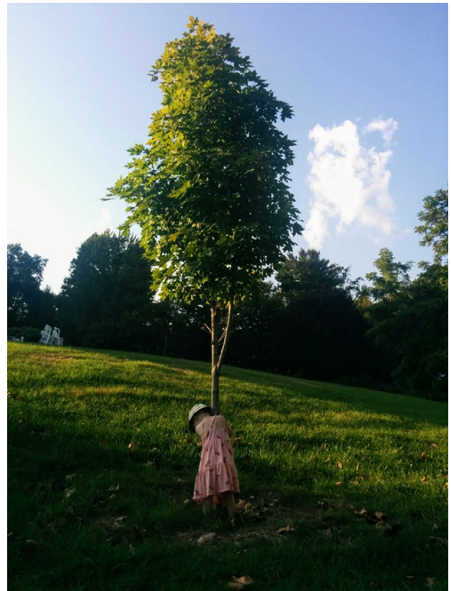
A tree at Stony Point Center in New York

There are many, many trees on the campus of Stony Point Center where I live as a member of the Community of Living Traditions, a multifaith community committed to the work of radical hospitality in the world and for all creation. Over the years I have learned the stories of several of the trees on the SPC grounds during community ‘tree walks.’ On these walks, we pause at a number of trees to share the stories and memories we have of the trees we encounter. We grieve by trees planted to mark the loss of good friends and children gone too soon. We note the beauty of those trees planted in grief, now firmly rooted like the memories of those they commemorate. We stop and celebrate by trees planted to mark the birth of babies; trees whose roots are nurtured by the placentas that sustained life in the womb. We offer gratitude at the base of some of the big, glorious maples on campus - gratitude for shade in spring and summer, for the blazing red-orange leaves of fall, for the sweet sap we collect in the cold of winter. The tree walks journey through all seasons of life and of creation. Together, we remember and are strengthened by the stories of Love’s presence in all seasons and of the new life that grows even from what we plant in our grief.