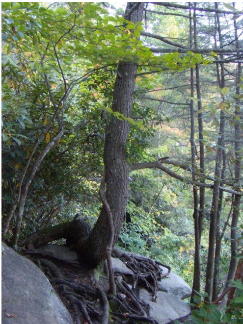
Tree roots growing over rock

This advent we will be endeavoring to wait, not with a low-grade fever of irritation but with anticipation, like those who know their tickets to Disney have already been purchased, or the answers to their deepest need have been written and are about to be revealed. We will be waiting together in community, sharing strength with each other as we wait.