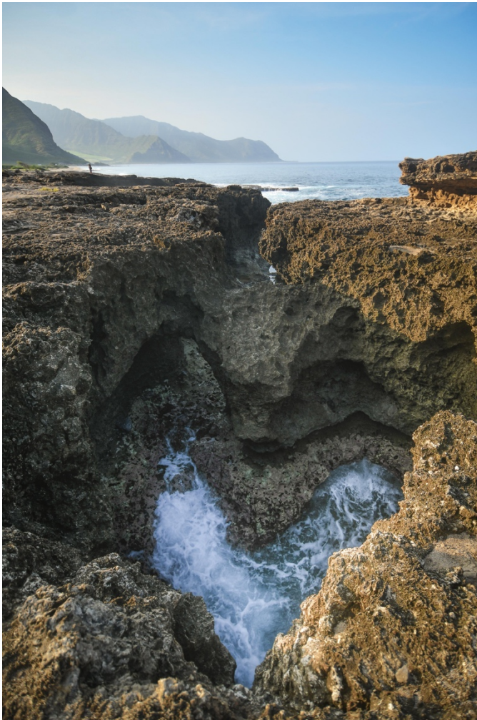
Heart at Kaena Point Oahu, HI

Where I live, it's easy to be in love with nature. I often spend time on the mountains and in the ocean and think about how in love I am with Earth—how it looks, how it feels, how it sustains me and those I care about. But do I really love the earth?