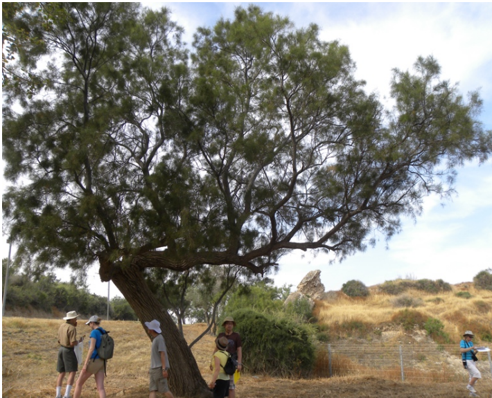
A tamarisk tree in Israel

“Bloom where you are planted” is an old saying that sounds almost biblical, but it is not. It was coined by a saint of the church, Saint Francis de Sales. The intention was to say, happy or not with your place in the world, keep being a disciple of Christ and growing in faith. But it begs the question, “Am I planted in the right place?” and “Is it possible to be the right person in the wrong place?”