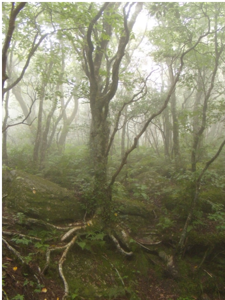
Beech trees in the fog

"My soul is filled with joy because the Lord will soon come, I will prepare a manger in my heart stripping it of all evil, Lord, I want you to be born in me in silence, I will be waiting for you, like the wind that awaits its rest as a fire that burns endlessly"