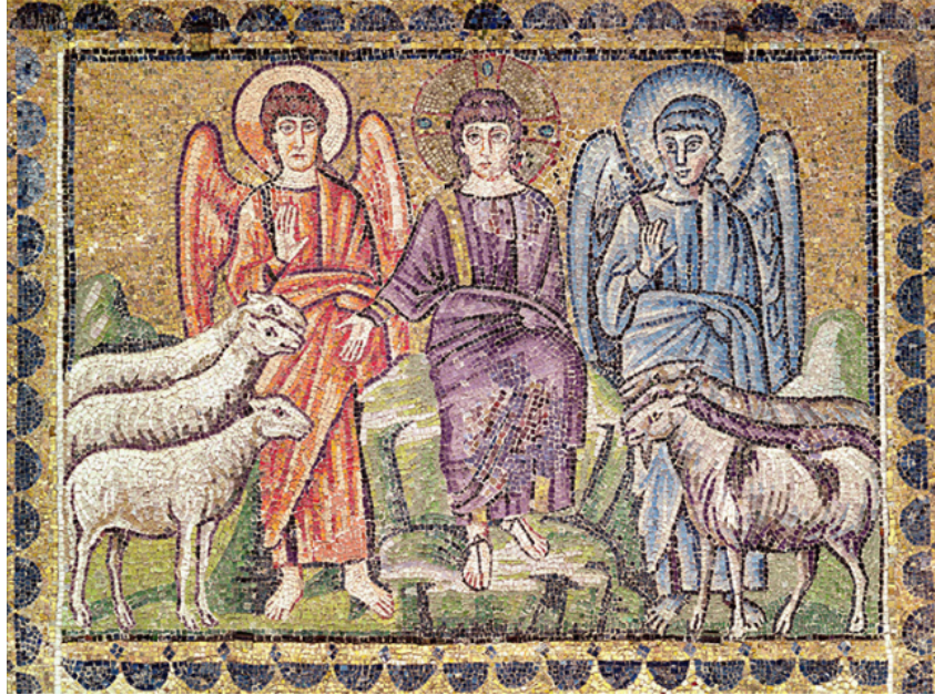
Christ dividing the sheep from the goats. Mosaic. Sant'Apollinare Nuovo, Ravenna, 6th century

Lord God, in all your infinite wisdom, show us your people how to honor your gift of Creation. Let us not be selfish with our gift, rather allow us to share as generously with each other as you have shared with us. Let us remember those in this world who still have not been able to realize God's abundance because we have taken more than what we need. Amen.