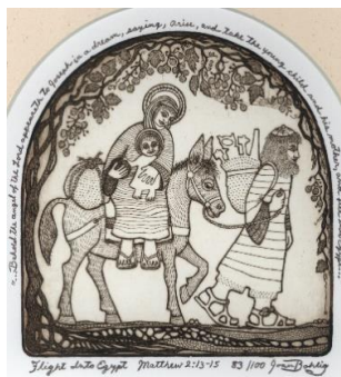
The Flight Into Egypt , by Joan Bohlig, etching, 1975, The Westminster Collection

Prayer: Lord of us all, In this season of creation and giving, grant us strength and wisdom to boldly take action on climate change in our churches, homes and locales and as citizens of Mother Earth, applying the Universal Golden Rule to all. Amen.