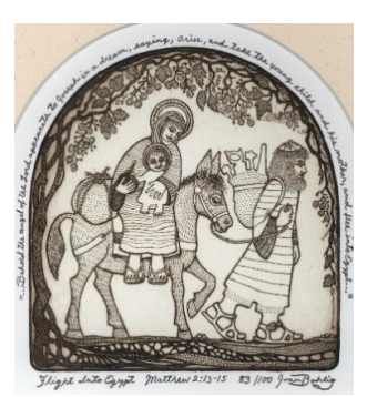
The Flight Into Egypt, by Joan Bohlig, etching, 1975, The Westminster Collection

Prayer: Lord of us all, In this season of creation and giving, grant us strength and wisdom to boldly take action on climate change in our churches, homes and locales and as citizens of Mother Earth, applying the Universal Golden Rule to all. Amen.