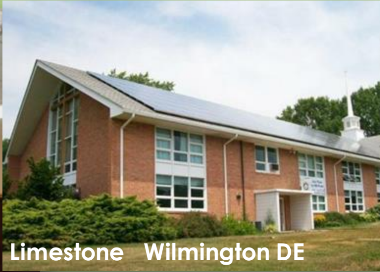
Limestone Wilmington DE