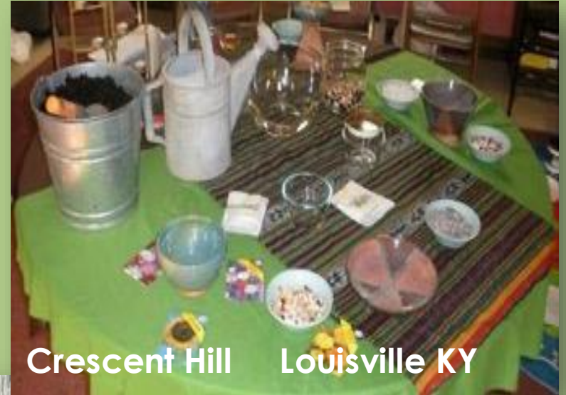
Crescent Hill Louisville KY