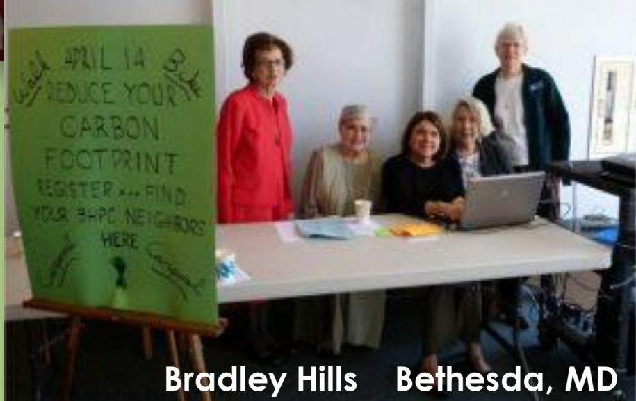
Bradley Hills Bethesda, MD