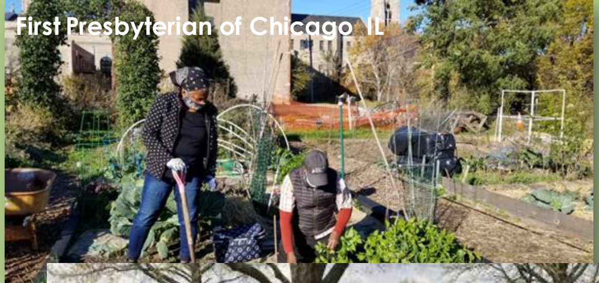
First Presbyterian of Chicago IL