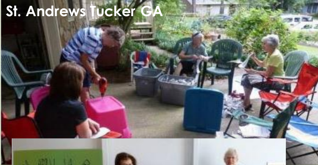
St. Andrews Tucker GA