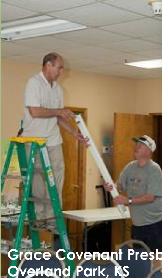
Grace Covenant Presbyterian Church Overland Park, KS