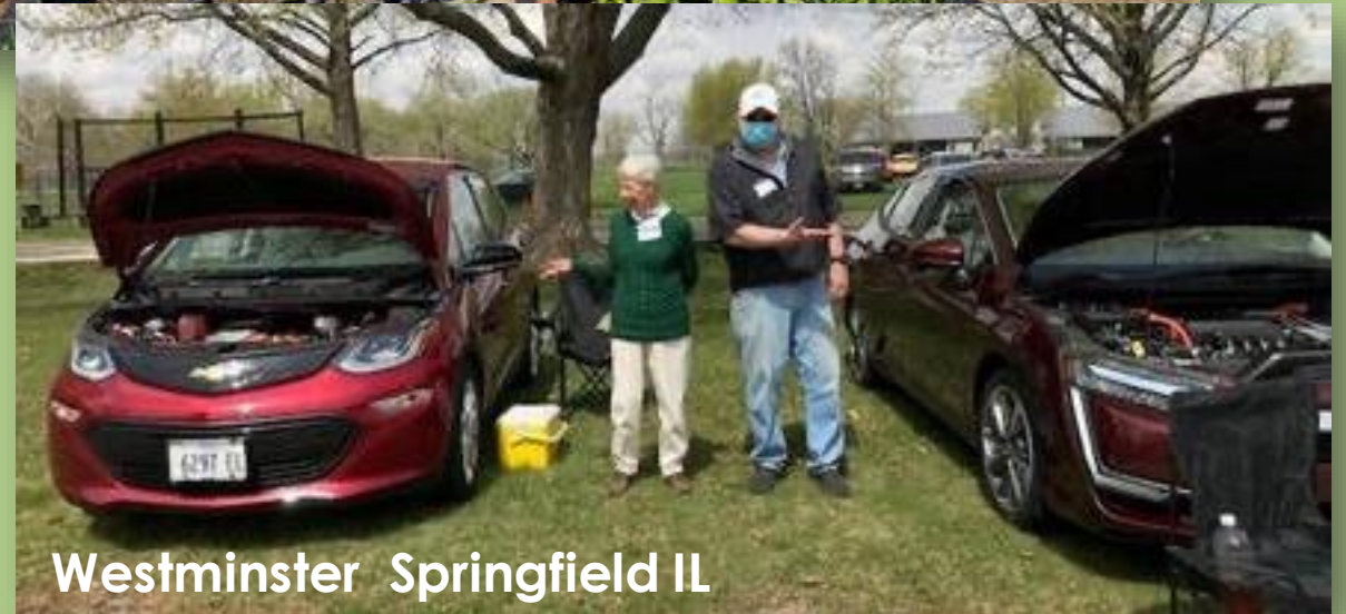
Westminster Springfield IL